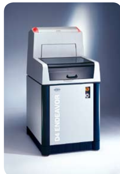
Figure 2: The D4 ENDEAVOR process diffractometer.